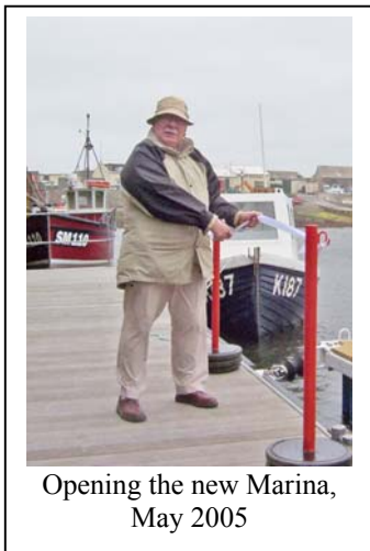
Opening the new Marina, May 2005

A very important part of the Westray Regattas could easily be over looked. From its earliest days, the RNLI sent the Lifeboat to the Westray Regattas. The Lifeboat escorted the boats around the course providing reassurance to sailors and spectators alike.